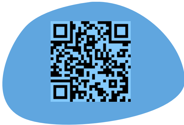
Sport Welfare Website