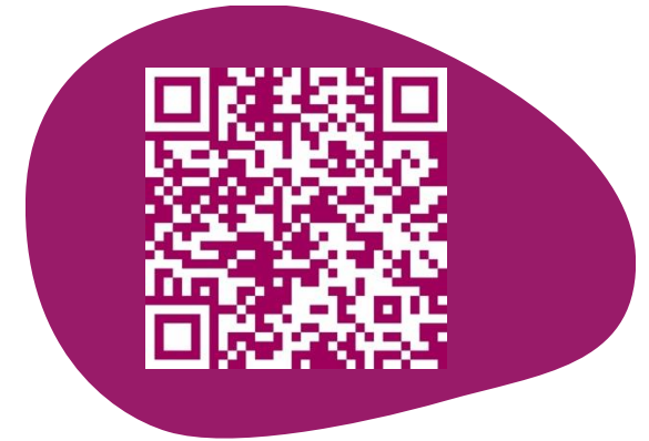
Sport Welfare Facebook Group