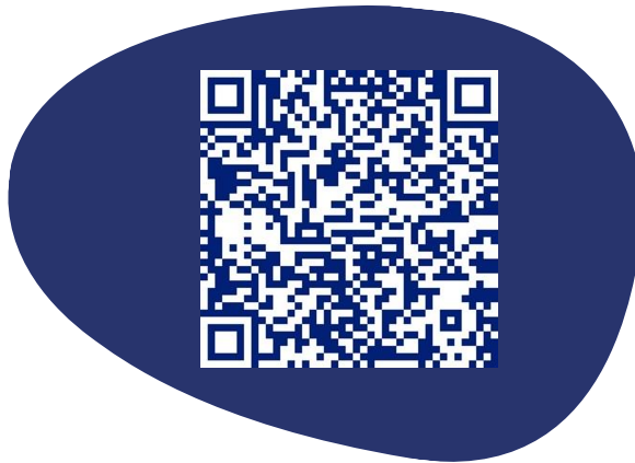
Sport Welfare Newsletter